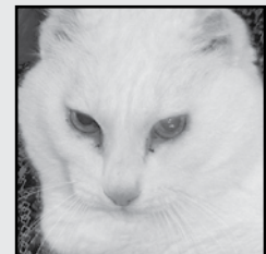
I'm Billy McPaw, the North County Humane Society Spokescat.

Store hours are Tuesday through Saturday, 10 a.m. to 4:30 p.m.