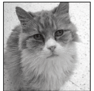
Woody died on Aug. 26.

Woody helped me on many other dome projects, but when he wasn't supervising me, he loved to just sit and be scratched, and I loved to oblige him. I will miss Woody. He holds a special place in my heart, as he does with all the shelter's staff. I'm on to the next project, Woody, and I'll do my best to keep up to your high standards.