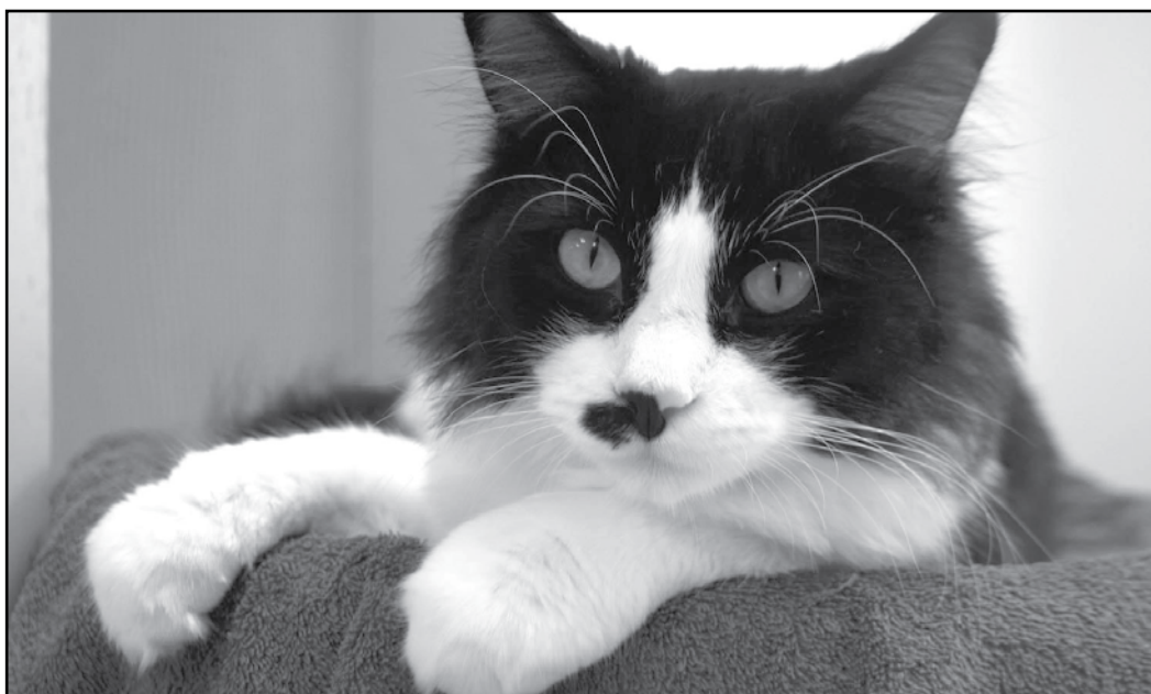
Meet Murphy, one of the many cats at the shelter looking for their forever homes.